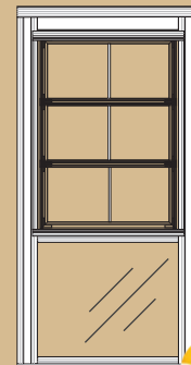
Glass Kick Plate