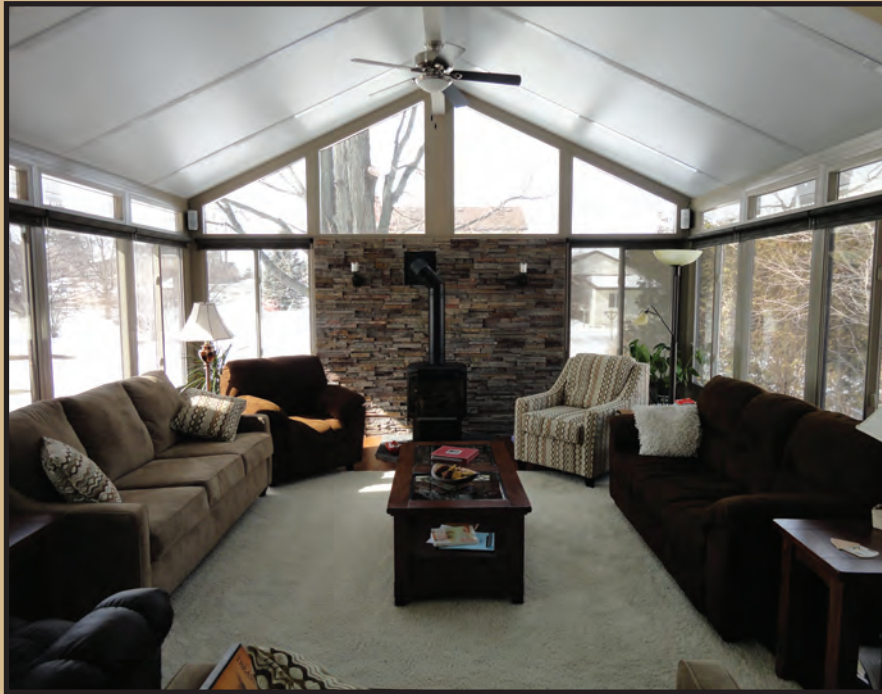
Gable All-Season Model 400

* Ask your Dealer about customizing your room application