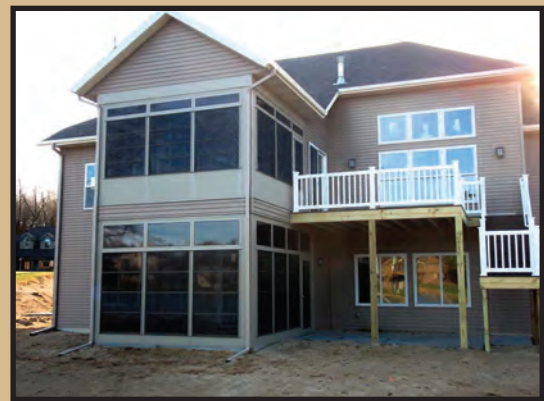
New Build Walls Under Conventional Roof