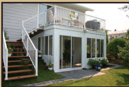
Under Existing Deck