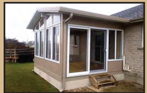
Gable Model 300