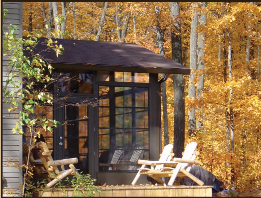
Model 200 WeatherMaster® Sunroom