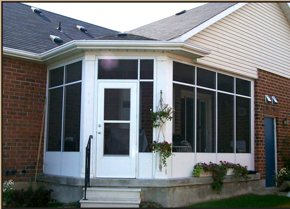
Model 100 Screen Room

Sunspace Model 100 can easily be upgraded to Model 200 at any time!