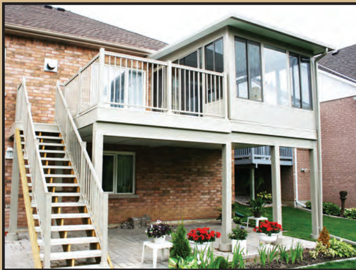
Model 300 Sunroom with Aluminum Deck & Railing

Roof systems available to meet your needs, whether it is for a cathedral ceiling or a contemporary studio pitch roof, over an existing deck or porch or perhaps even a carport.