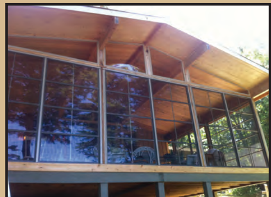
Custom Heights up to 8 ft