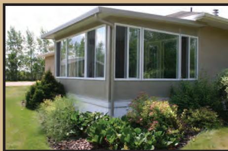
Studio Model 300