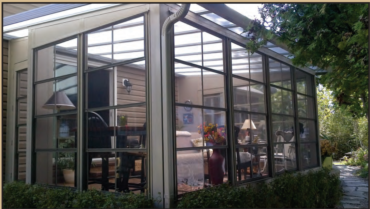
Model 200 WeatherMaster® Sunroom

WeatherMaster® Vinyl Windows are made with durable ViewFlex glazed vinyl, and are available in 4 different tint colors: clear, smoke grey, dark grey and bronze.